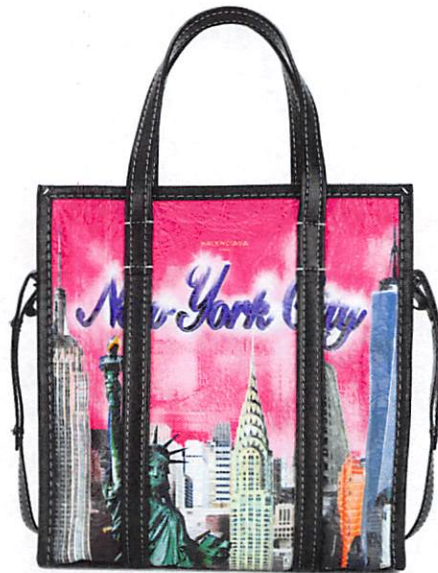
Defendant's Tote Bag