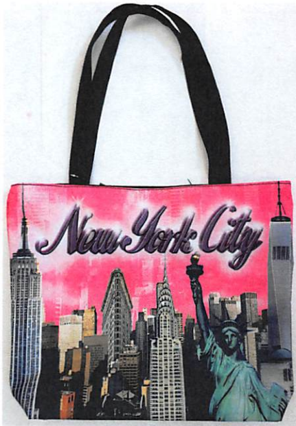
Plaintiff's Tote Bag